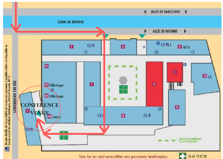
Auditorium MSoor1 at the Manufacture des tabacs